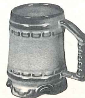
*M1—15 OZ. Stein—2.00