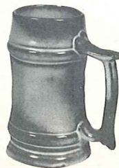
*M2—18 OZ. STEIN—2.00