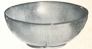
*224—8" ROUND BOWL—2.50