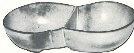
*4QD—11" DIVIDED BOWL—4.00