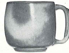
*4M—18 OZ. MUG—2.00