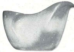
4A—8 OZ. CREAMER—1.75