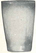
*5L—12 OZ. TUMBLER—1.50