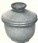
*BP—6 OZ. BEAN POT OR CUSTARD/WITH LID—2.00