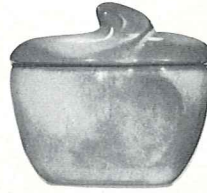
4B—SUGAR WITH LID—2.25