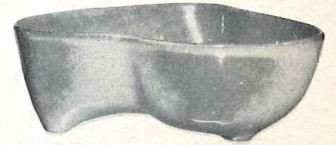
*4N—24 OZ. VEGETABLE—2.00