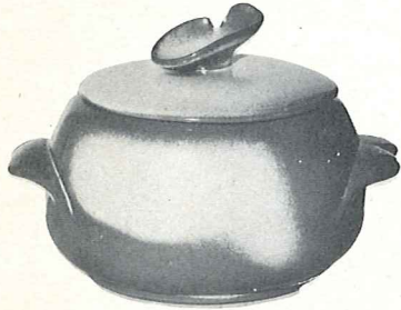
*4V—2 QT. BAKER/BEAN POT—5.00