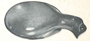
*4Y—6" SPOON HOLDER—1.50