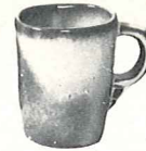
*5CC—5 OZ. TEACUP—1.25