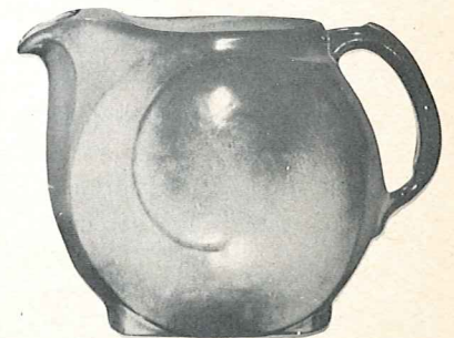
*4D—2 QT. PITCHER—5.00

THIS PAGE AVAILABLE IN PRAIRIE GREEN, DESERT GOLD AND BROWN SATIN, EXCEPT WHERE NOTED*