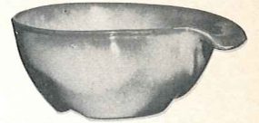
*4X—14 OZ. CEREAL—1.50