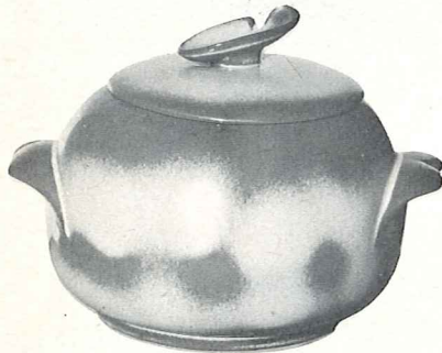
*4W—3 QT. BAKER/BEAN POT—6.50